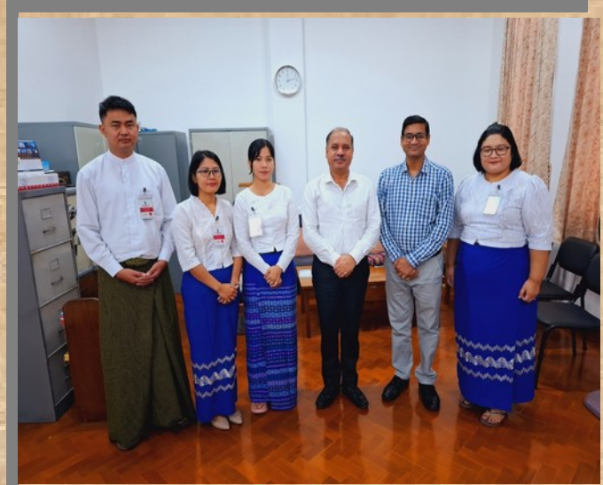
Briefing session with ITEC participants

In keeping with the Ministry’s policy of sharing latest developments through capacity building offerings through ITEC, “human rights and good governance” is being included as a new stream of courses. NHRC, India conducted the training program for senior officials/officers of NHRIs/human rights related organizations, focusing on neighborhood, Africa, SE Asia, Central Asia and LAC regions. A Briefing session was held on 08 Nov 2024 for 4-Myanmar participants from Myanmar Human Rights Commission.