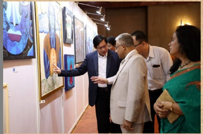
CM Yangon region and Ambassador of India

Myanmar dignitaries, diplomatic corps, intelligentsia & community members.