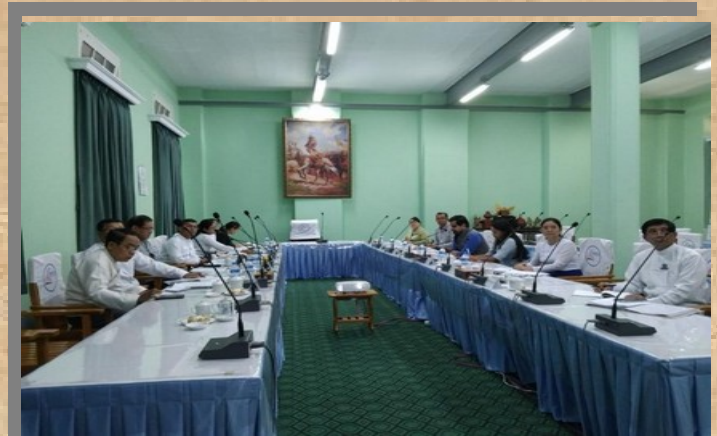
Sarsobeikman JPMC meeting held in Yangon

The second Joint Working Committee (JWC) meeting for construction/ up-gradation of the Kalewa-Yargyi road section of the trilateral highway in Myanmar was held in hybrid format on 5th December 2024. The meeting was co-chaired by JS (DPA-III), MEA and Director General (Department of Highways), Ministry of Construction (MoC), GoM. Ambassador of India, First Secretary (DC), First Secretary (LO), Second Secretary (Political) and Project Head of Kalewa-Yargyi Project from NHAI (PIU) and Project Manager for IMT Expressway (Contractor) attended the meeting in Nay Pyi Taw along with officials from Ministry of Construction. Officials from DPA-III Division, BM Division, IFD attended the meeting virtually.