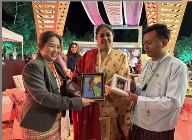
Myanmar delegation during International Travel Mart

Two travel and tour operators and one blogger participated in the 12th edition of International Travel Mart (ITM) held in Kaziranga, Assam, India from 26-29 November, 2024.