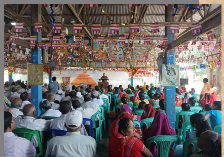
Lecture on Ramayana at Zeyawaddy