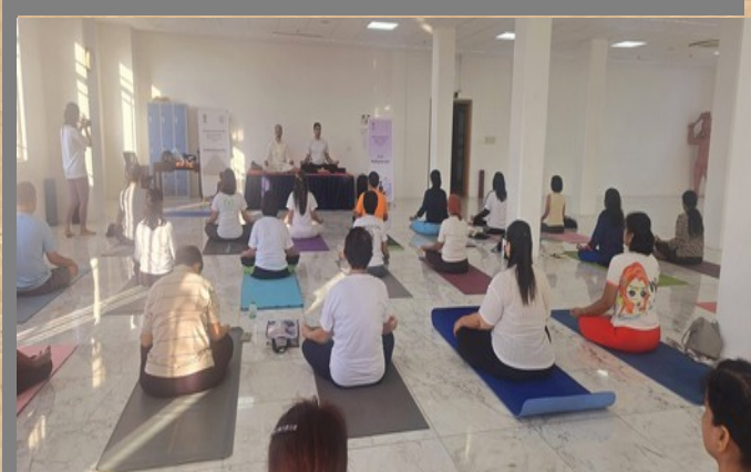
Meditation session at SVCC, Yangon

Commemorating the first World Meditation Day, an inspiring meditation session was conducted on December 23, 2024 at Swami Vivekananda Cultural Centre, in collaboration with The Art of Living, with attendees from different walks of life, dwelt on its many mental health, social and mindfulness benefits.