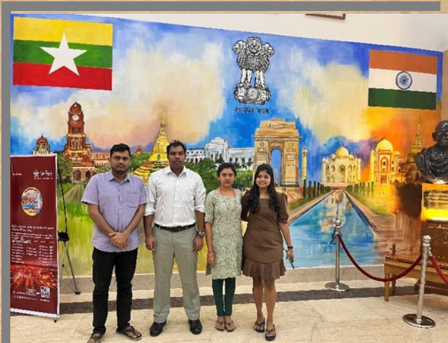
participants selected for 80th KIP