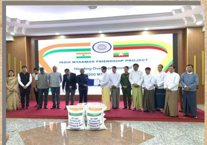
H.E. Sh. Abhay Thakur donated 2200MT rice

A cargo vessel carrying 86 containers of 2200 MT of rice arrived in Yangon on 11 December 2024 and the consignment was handed over by Ambassador Abhay Thakur at the Yangon Port, in the presence of Chief Minister of Yangon Region U Soe Thein, Myanmar Red Cross Society and Civil Society organizations. This contribution is expected to benefit approximately 140,000 needy individuals, including children, women, youth, elderly people and persons with disabilities.