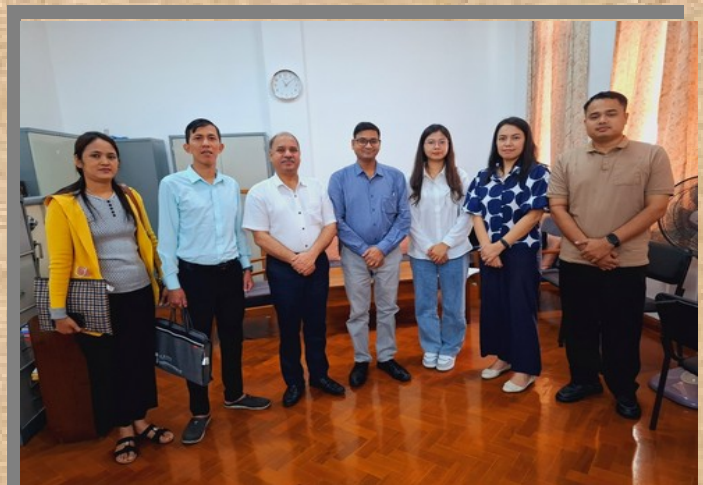
Briefing session with ITEC participants

A Briefing session was held on 31 Dec 2024 for 05-Myanmar participants from the Ministry of Construction, Ministry of Planning and Finance, Anti-Corruption Commission, Pyidaungsu Hluttaw and Constitutional Tribunal of the Union.