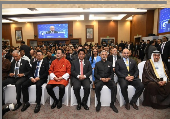
Dr. S. Jaishankar, EAM, attends the event