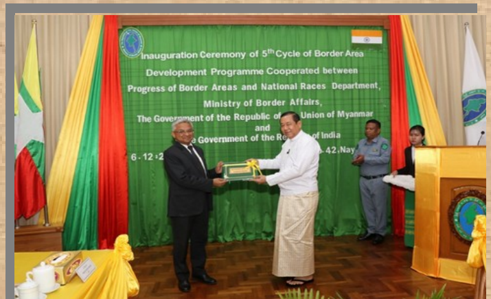
Inuguration of BADP and RSDP projects by H.E. Sh. Abhay Thakur

The inauguration ceremony of new projects completed under RSDP and BADP projects was held in Nay Pyi Taw on 5th and 6th December 2024 respectively. The respective ceremonies were graced by Union Minister for Social Welfare, Relief and Resettlement (MOSWRR) Dr. Soe Win and Union Minister for Border Affairs (MOBA) Lt Gen. Tun Tun Naung, Ambassador Shri Abhay Thakur, dignitaries from the concerned Ministries, concerned States and Regions of Myanmar and officials from the Embassy of India.