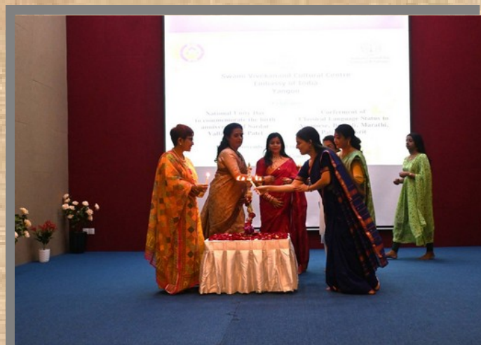
Lightning of lamp ceremony during event