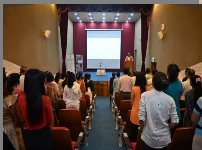
Janjatiya Gaurav Divas celebrated at SVCC, Yangon