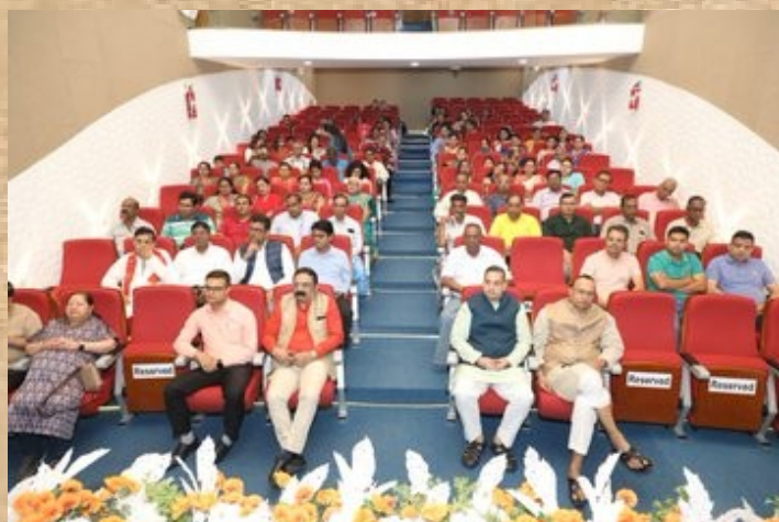
Lecture on Ramayana at SVCC, Yangon

Under the #PCTD (Promotion of Cultural ties with Diaspora) scheme of Ministry of External Affairs, Government of India and Diaspora India Connect, lectures on the timeless influence and significance of Ramayana were held at India Centre on November 30, 2024 and at Zeyawaddy on December 21, 2024. This initiative celebrates the enduring legacy of the Ramayana, emphasizing its relevance in contemporary times and its influence across diverse cultures.