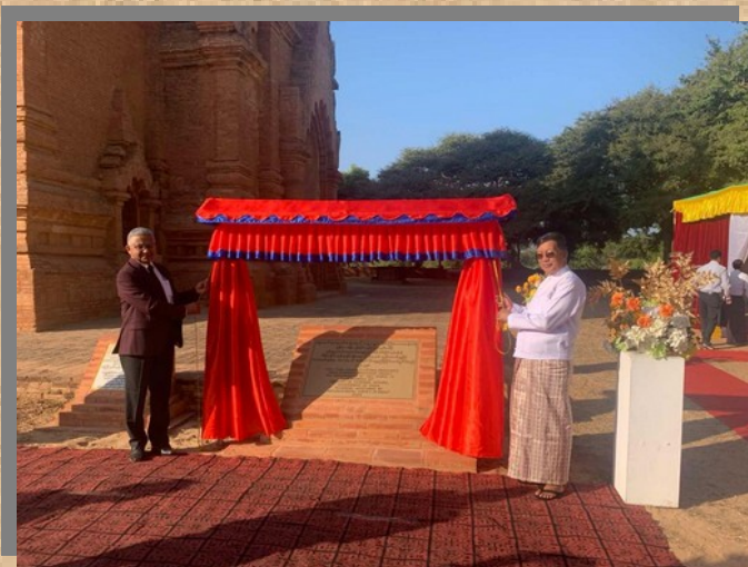
H.E. Sh. Abhay Thakur inaugurating the earthquake affected pagodas after conservation

The handing-over ceremony of the Phase-I, 11 monuments (22 works) for the structural conservation and chemical preservation of earthquake affected Pagodas in Bagan was concluded at monument no.1401 on 13 December 2024. The Union Minister for Religious Affairs and Culture (MoRAC), H.E. U Tin Oo Lwin (TOL) and Ambassador inaugurated the monument in the presence to Deputy Minister of Border Affairs, Senior Ministers from Mandalay Regional Government and officials from Government of Myanmar.