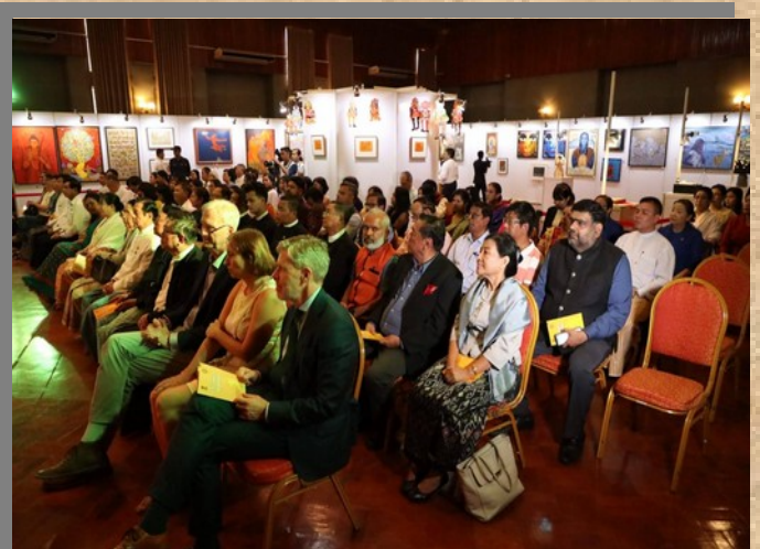
Special viewing of Ramayana exhibition