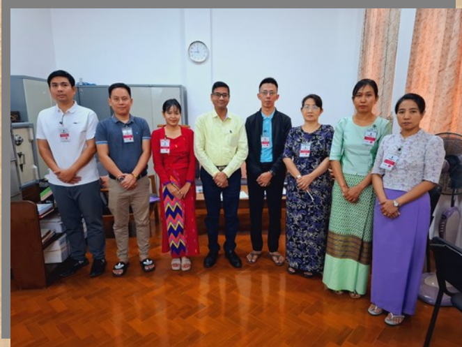
Briefing session with ITEC participants

A Briefing session was held on 08 Nov 2024 for 07-Myanmar participants from the Ministry of Commerce (02), Ministry of Education, Ministry of Science and Technology (02), Ministry of Industry and Ministry of Transport and Communications.