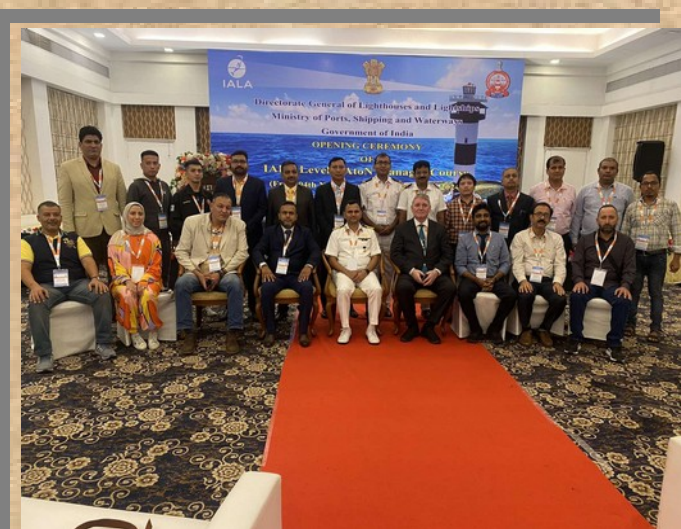
Official photo during navigation manager training