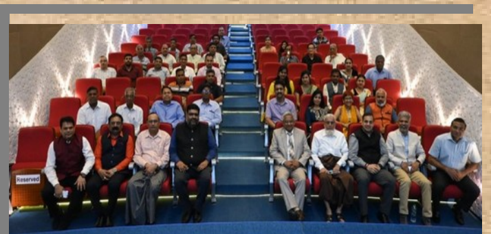
During website launch programme of PBD

The Website Launch Programme of Pravasi Bharatiya Divas was organized on 12 November, 2024 at India Centre, Yangon. Representatives of leading Indian community organizations joined Ambassador Abhay Thakur and Mission team, for the launch of the 18th Pravasi Bharatiya Divas website https://pbindia.gov.in , by Hon'ble EAM, Dr S. Jaishankar and Hon'ble Chief Minister of Odisha, Mohan Charan Majhi with Hon'ble Union Minister of State for Environment, Forest and Climate Change; and External Affairs Kirtivardhan Singh . PIOs were encouraged to register for 18th Pravasi Bharatiya Divas in Bhubaneswar, Odisha from 8-10 January, 2025. A power point presentation on Pravasi Bharatiya Divas prepared by Consular Wing, EOI, Yangon was also displayed during the programme.