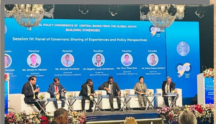
During the meeting