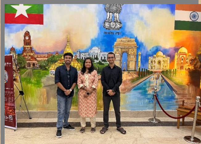
Participants selected for 81st KIP