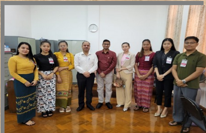
During interaction session with ITEC participants

Interaction sessions were held for participants from Union Election Commission Myanmar.