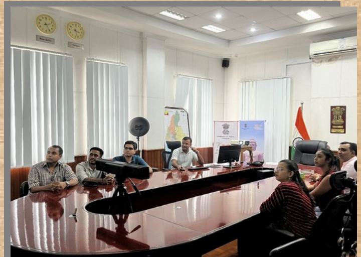
Pre-departure orientation session with KIP participants at Business Center, EoI Yangon

Pre-departure Orientation Programme for 80th and 81st KIP editions which coincided with 18th Pravasi Bharatiya Divas (PBD) Convention were conducted on 26.12.2024 and 27.12.2024 respectively. The 80th and 81st KIPs were held from 29 December 2024 to 17 January 2025 and 02 January to 21 January 2025. 04 participants for 80th KIP and 03 Participants for 81st KIP were selected from this Mission.