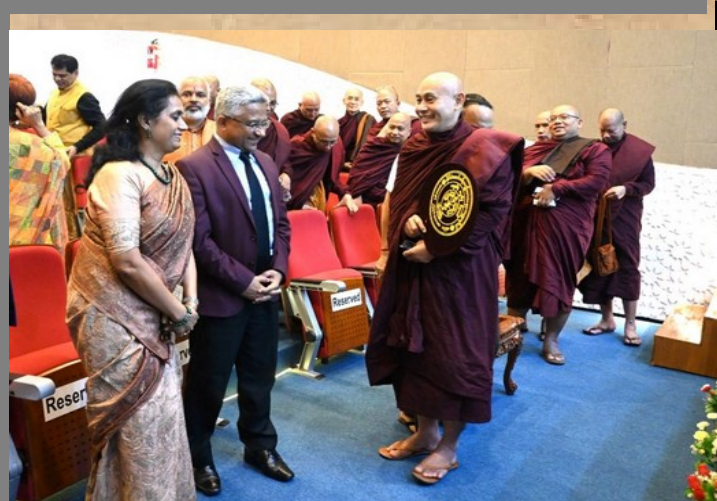
Interactions with Sayadaws during event