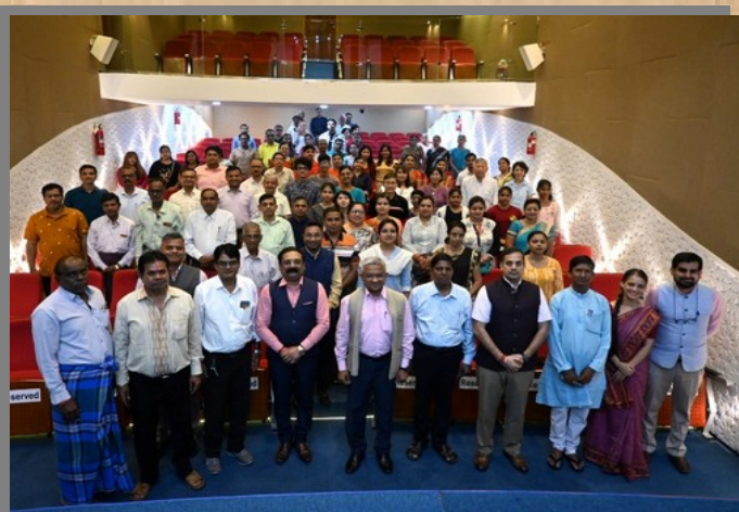
Group photo during Janjatiya Gaurav Divas