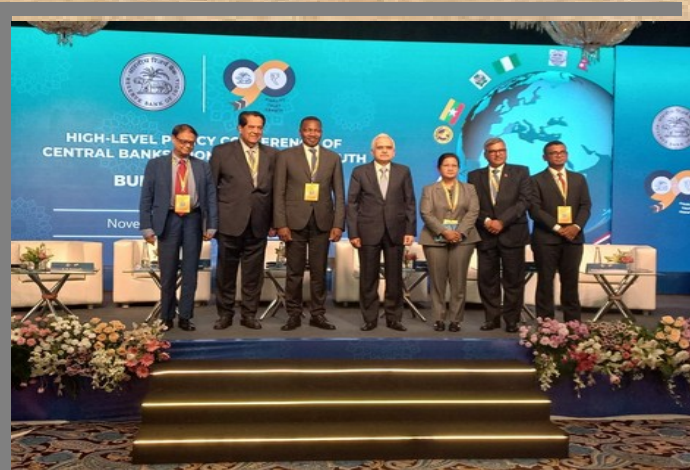
Group photo during the meeting

Myanmar delegation led by the Central Bank of Myanmar Governor attended the High-Level Policy Conference of Central Banks from the Global South organized by the Reserve Bank of India in Mumbai from 20 to 22 November. She also met the governor of the Reserve Bank of India at the bilateral meeting and discussed capacity-building matters for bank staff and the expansion of local currency settlement in trading with India and Myanmar.